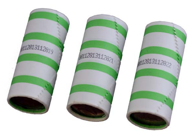
© LAUREL BANK MACHINES CO., LTD. All rights reserved. All data contained in this leaflet are subject to change without notice. www.lbm.co.jp